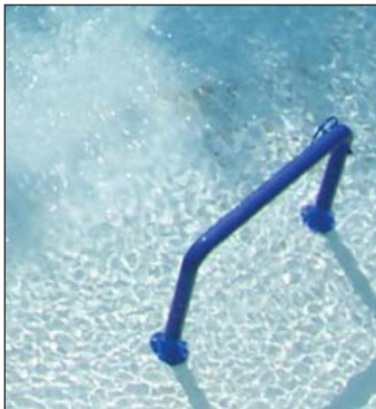
Spray Curtain Model 1800-68