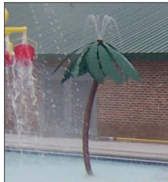
Palm Tree Spray Model 1800-77-2