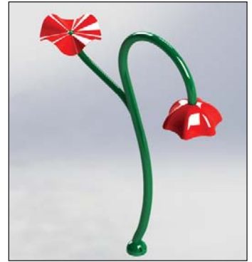
Urban Rain Series II Model 1800-135