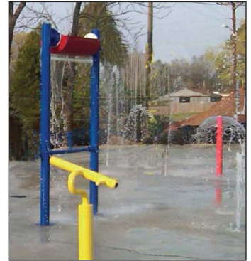
Large Dumping Bucket Model 1800-49