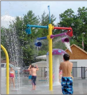
Tumbling Buckets - 4 bucket model Model 1800-50-4