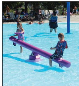
Teeter Totter Model 1800-99