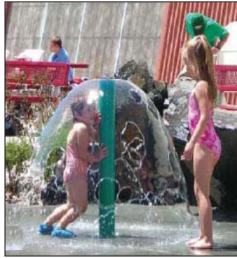
Bubble Tent Model 1800-61