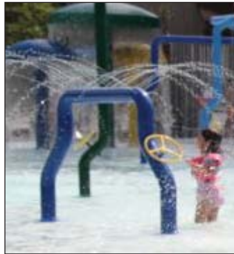
Double Spray Curtain Model 1800-95