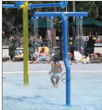
Misty Spray Model 1800-69