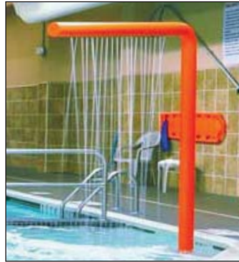
Water Curtain Model 1800-70-1