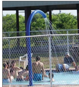
Angled Spray Pole Model 1800-86