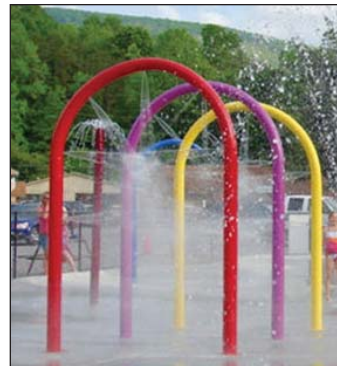
Spray Arch Model 1800-72