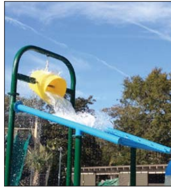
Bucket Tower Model 1800-45