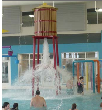
Water Tower Model 1800-122