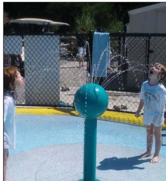
Spray Orb Model 1800-87