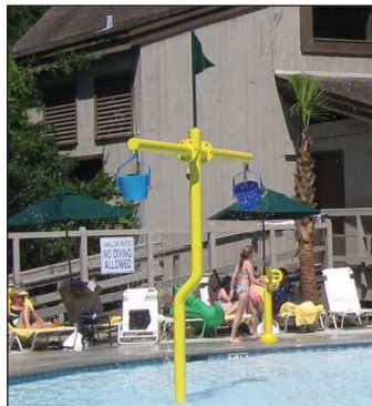
Tumbling Buckets - 2 bucket model Model 1800-50-2