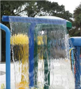
Water Wall Model 1800-55