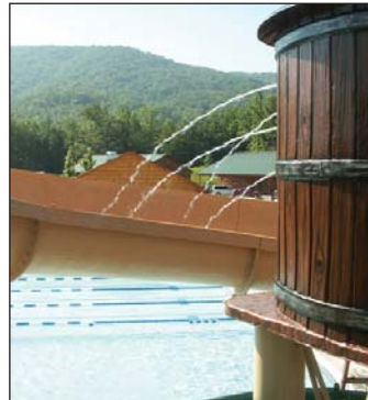
Water Tower Spray Model 1800-22