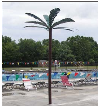
Palm Tree Spray Model 1800-77-1