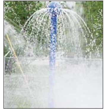
Crystal Dome Spray Model 1800-90