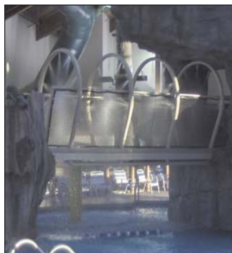
Spray Tunnel Bridge Model 1800-137