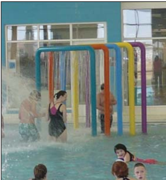
Water Curtain Tunnel Model 1800-71