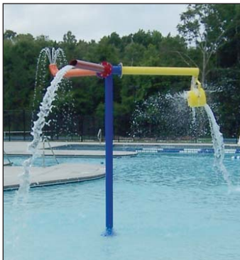
Thrilling Splash Trio Model 1800-123