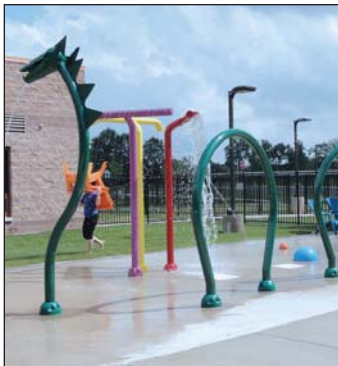
Sea Dragon Model 1800-51