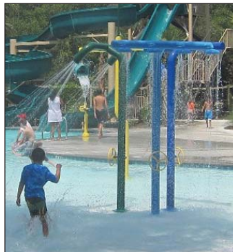
Trio of Fun Model 1800-94