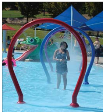
Spray Tunnel Model 1800-73