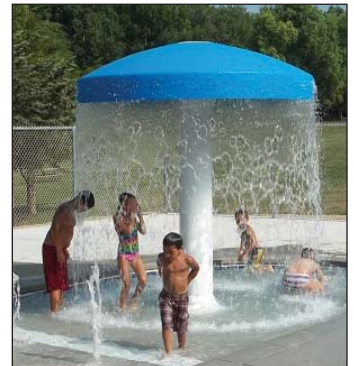
7' 6" Mushroom Spray Model 1800-17