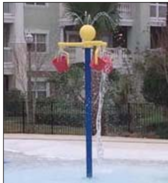
Splash & Spray Trio Model 1800-43