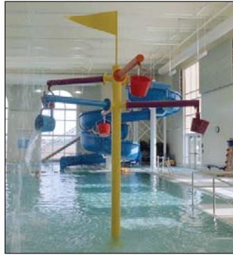
Tumbling Buckets - 6 bucket model Model 1800-50-6