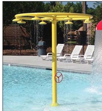
Misty Spray Circle Model 1800-96