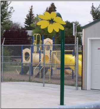
Daisy Spray Pole Model 1800-30