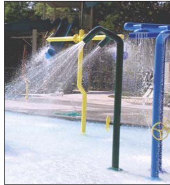
Double Shooter Model 1800-56