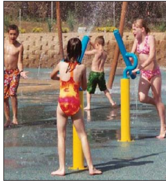
Water Cannon Model 1800-20