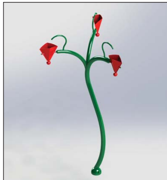
Silver Falls Model 1800-133