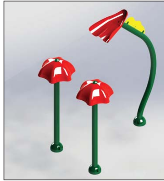
Urban Rainforest Model 1800-134