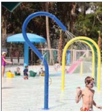
Angle Spray , bent, water flow wheel Model 1800-86