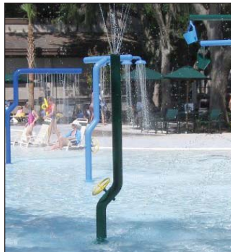
Spray Pole Model 1800-78