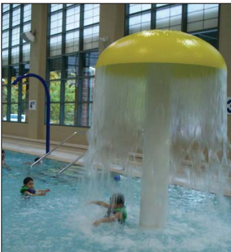
5' Mushroom Spray Model 1800-18