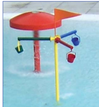
Tumbling Buckets - 3 bucket model Model 1800-50-3